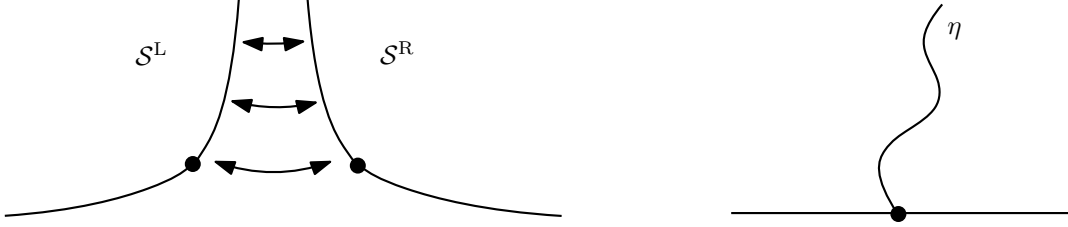
Figure 1: Illustration of the conformal welding problem. We get a topological half-plane by welding together the two surfaces \mathcal{S}^L and \mathcal{S}^R . By Corollary 1.4, if \mathcal{S}^L and \mathcal{S}^R are independent (2, 2) -quantum wedges and the welding is defined in terms of 2-LQG boundary length, then the resulting surface (a (2, 1) -quantum wedge) has an a.s. uniquely defined conformal structure, and the interface \eta has the law of an \text{SLE}_4 .