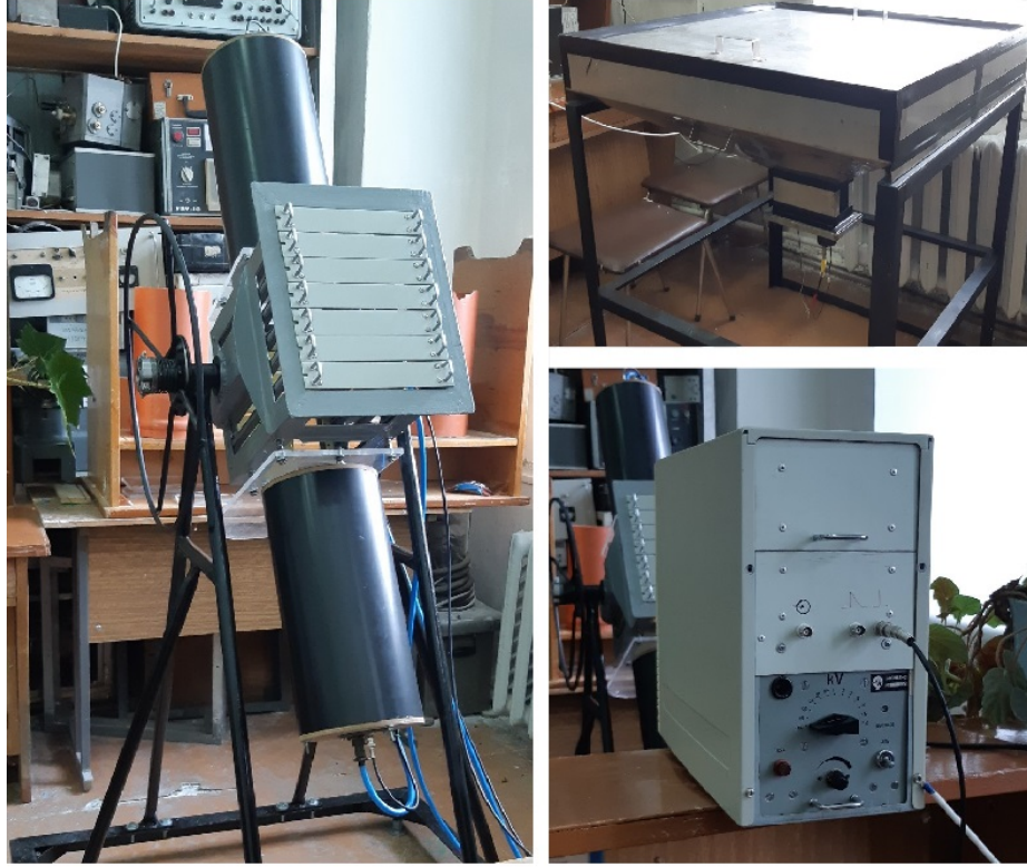
Fig. 2. Laboratory setups developed for the astroparticle course. Left: The telescope for studying the secondary component of cosmic rays. Top right: The stand for studying the fluctuations of ionization losses. Bottom right: The stand for study the main characteristics of photomultipliers (PMT).

In the frame of this course three laboratory setups (see Fig. 2) have been developed to familiarize students with the astrophysics detectors. Students perform measurements on these setups, and analyze and interpret the data using knowledge obtained on the lectures and seminars.