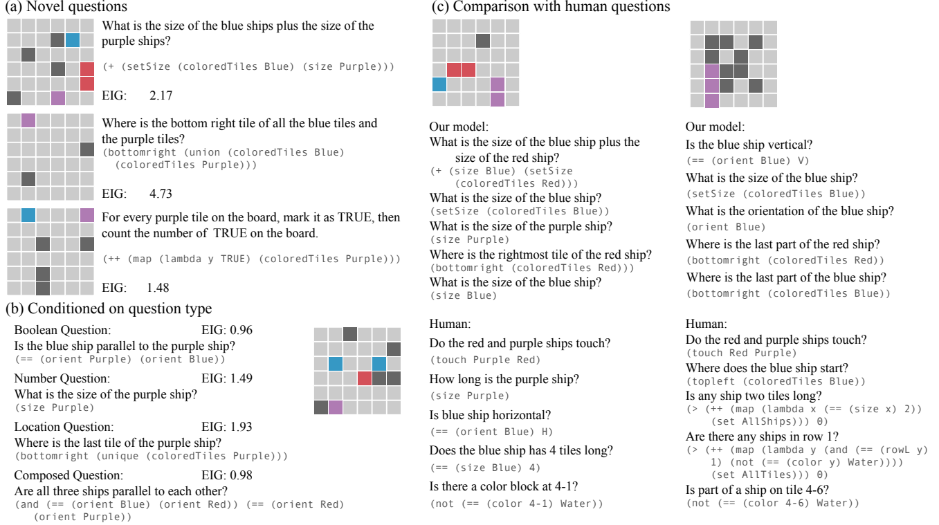
Figure 3: Examples of model-generated questions. The natural language translations of the question programs are provided for interpretation. (a) shows three novel questions generated by the RL model, (b) shows an example of the model generating different type of questions by conditioning on the decoder, (c) shows questions generated by our model as well as humans.

In Figure 3c, we compare arbitrary samples from the model and people in the question-asking task. These examples again suggest that our model is able to generate clever and human-like questions. There are also meaningful differences; people often ask true/false questions as mentioned before, and people sometimes ask questions with quantifiers such as “any” and “all”, which are operationalized in program form with lambda functions. These questions are complicated in representation and not favored by our model.