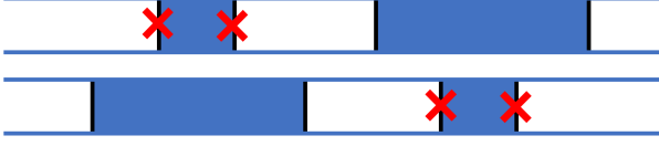
FIG. 2. Pictorial representation of the commutation on each index between two \{a^\dagger a^\dagger a a\}_{\text{JW}} rectangles. All indices commute except possibly the 8 indices with black bars—these indices anti-commute when the black bar ( X or Y ) is vertically aligned with a blue rectangle Z . In this example, there are an even (4) number of anti-commuting terms, so the two patterns commute.

cases, which provide useful intuition for the general case. In particular, when sliding one of the \{p, q, r, s\} indices while keeping \{i, j, k, l\} fixed, the parity of the number of anti-commuting indices is invariant. Thus, this parity is always even, and two \{a_p^\dagger a_q^\dagger a_r a_s\}_{\text{JW}} and \{a_i^\dagger a_j^\dagger a_k a_l\}_{\text{JW}} terms with disjoint indices always commute, as claimed in Theorem 1.