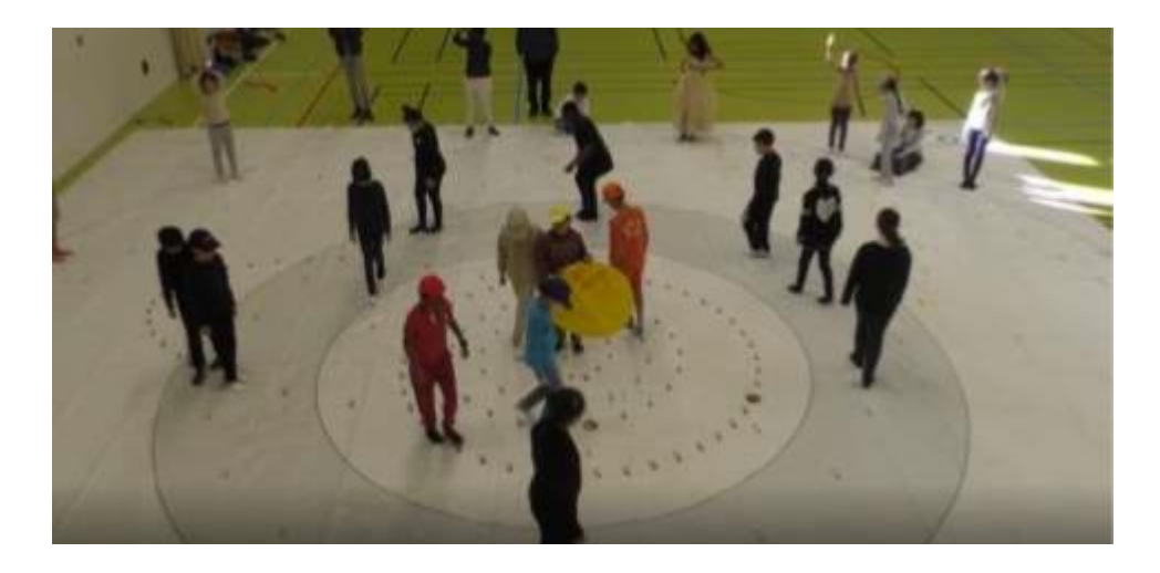
Figure 1. The "Human Orrery": Pupils enact planets (Mercury to Jupiter), asteroids and comets (in black) along their orbits around the Sun