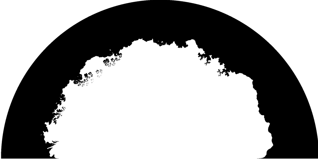
FIGURE 3. The upper half of the slice \Upsilon_2^{cp} \cap (\mathbb{D} \times \{1.8\}) plotted using Theorem 1. Specifically, the plotted white points were shown to be in the complement of \Upsilon_2^{cp} (by checking the condition of Theorem 1 for all m \leq 18 ).

§4: Roots in \mathbb{D} of reducible Parry polynomials proves Theorem 4.5, which implies that all roots in the unit disk of all Parry polynomials associated to admissible words are in the teapot.