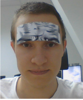
Fig. 5. Adversarial forehead

training, 3 photos were used for validation in digital domain and 3 photos were used for the test in the physical domain. The patch of this type is illustrated in Fig. 5 and in Fig. 6 .