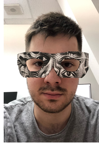
Fig. 3. Adversarial eyeglasses

1) Attacking eyeglasses : In this case, we use a patch of the form of eyeglasses rim (front view), where the frame and bridge of eyeglasses are used for adversarial pattern application. It turned out that the size of these parts is crucial for the success of the attack. Thus, we decided to use an eyeglasses model with a big frame and of size 16.5 \times 6.4 cm. Example of the adversarial patch of this form is presented in Fig. 3 and Fig. 4 .