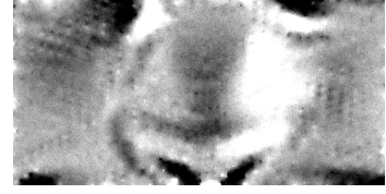
Fig. 8. Example of adversarial sticker on nose

In all three above scenarios, training procedure was conducted for 10000 iterations of the method described before.