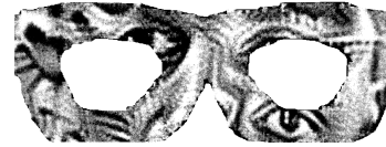
Fig. 4. Example of adversarial eyeglasses

In this scenario, 14 photos were used for training, 3 photos were used for validation in the digital domain, and 5 photos were used for the test in the physical domain.