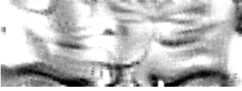
Fig. 6. Example of adversarial sticker on forehead

3) Attacking nose: In this case, we used a rectangular patch of size 12 \times 6 cells; the width of one cell is 0.7 cm. An example of adversarial sticker is depicted in Fig. 7 and Fig. 8 . We varied length in cells of the patch. During experiments, we found out that the height of the patch less than 6 cell is not enough for the successful attack even in the digital domain. but it was found out that increasing of size of patch is not enough for transferability of attack to the physical domain.