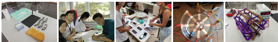
(a) Cloud chamber setup (b) Laser diffraction experiment (c) Interns measuring the speed of light with chocolate on microwave (d) Salad bowl experiment (e) Model of the ATLAS toroid magnet