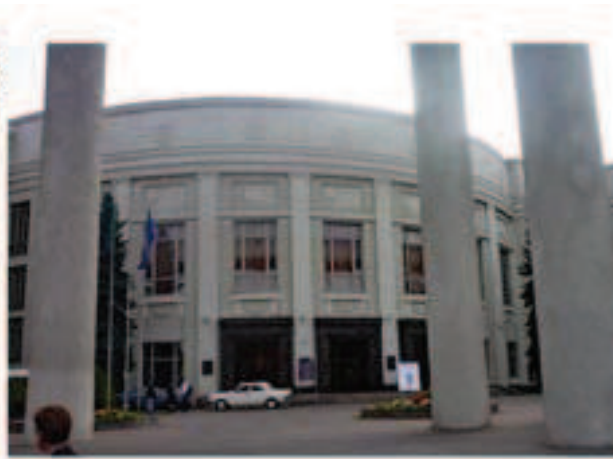
Entrance to the Belarus Academy of Sciences