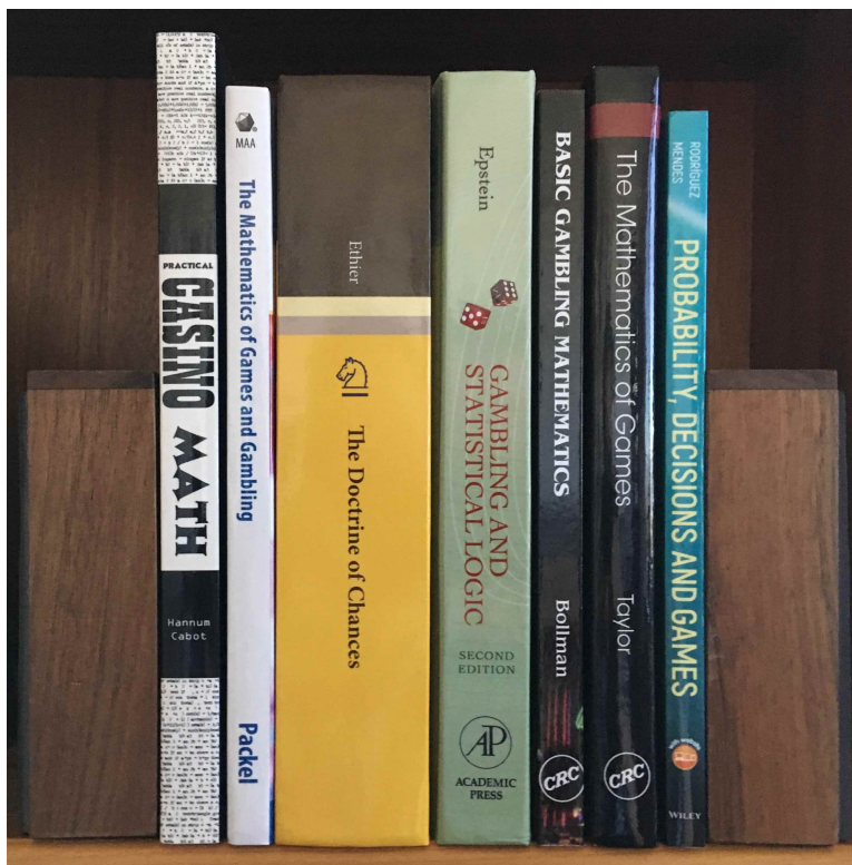
Figure 1: The seven textbooks compared here.

that students did not appreciate in-depth coverage of topics such as blackjack, poker, and game theory. We will explain later why we believe that the students were mistaken.