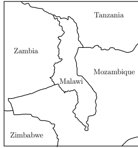
Figure 1. A blank map of the geographical region surrounding Malawi.

Example 3.2. Consider the following problem. We want to colour a political map of the geographical region surrounding Malawi using 3 colours – say red, green and yellow – with the condition that adjacent countries should be coloured differently. A blank map is pictured in Figure 1.