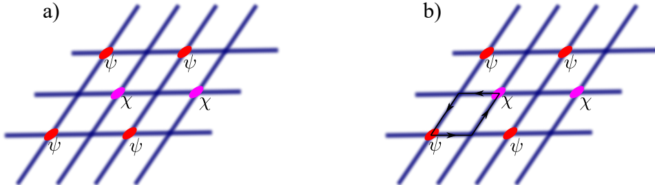
Fig. 2 Loop method for obtaining the plaquette terms. In the panel a) it is depicted the positions of the auxiliary fermions that are used to construct the plaquette term using gauge invariant building blocks. One of the species, say \psi , is represented in red and placed on sites with both coordinates even. In turn \chi , in pink, is placed on sites with both coordinates odd. This correspond to the ground-state of 57. In the panel b) it is represented a virtual process that gives rise to a plaquette term.