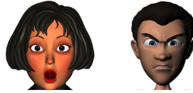
Figure 1. Two new characters added to FERG-DB with surprise expression (left) and anger expression (right).

We have extended FERG-DB by adding two new char-