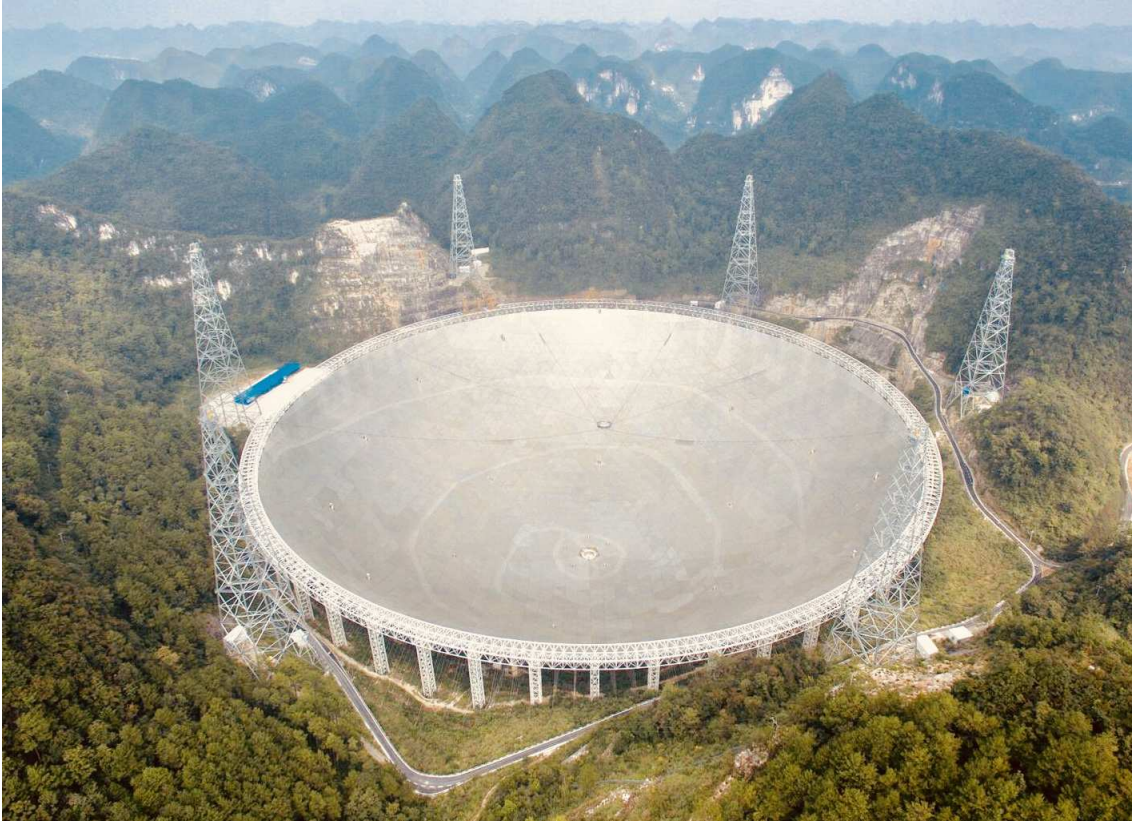
Fig. 1: The photo of FAST

using drift scanning method, and among them 65 have been identified as pulsar. A pulsar with interesting emission properties have been discovered (Zhang, Li & George et al. 2019). Figure 1 is a photo of FAST.