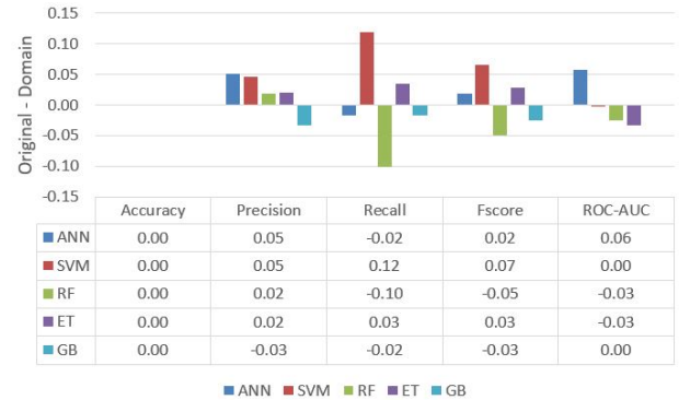
Figure 2: Dispersion in performance—original features minus domain-related features

quantify explainability, we need to calculate the interaction strength ( I ) too. We measure the interaction strength among features using R’s iml package that uses the partial dependence of an individual features as the basis for calculating interaction strength ( I ).