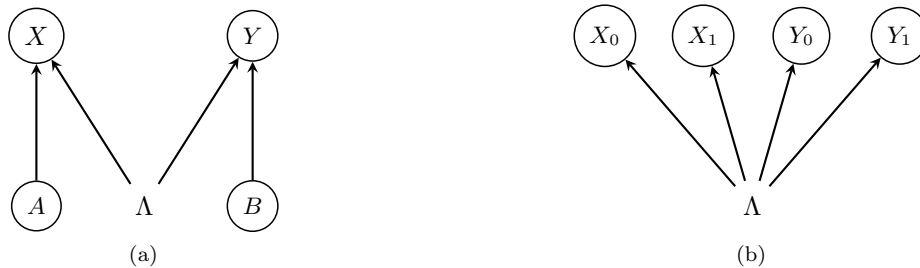
FIG. 1: (a) The bipartite Bell causal structure. The nodes A and B represent the random variables corresponding to independently chosen inputs, while X and Y represent the random variables corresponding to the outputs. \Lambda is an unobserved node representing the common cause of X and Y . (b) The post-selected Bell causal structure for two parties. The observed nodes X_a represent the outputs when the input is a \in \{0, 1\} and likewise for Y_b . Note that X_0 and X_1 are never simultaneously observed and likewise Y_0 and Y_1 .

version of the Bell causal structure shown in Figure 1(b) and found entropic inequalities that hold for all classical distributions. These can be violated when one or more of the unobserved nodes are quantum, and hence behave like entropic versions of Bell inequalities.