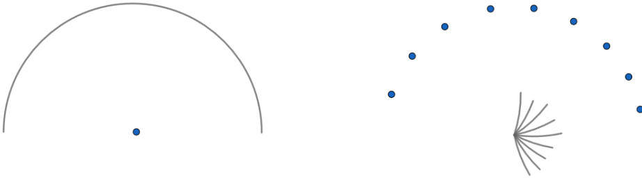
Figure 1: Operation on unit circular arcs

We construct a dipole Kakeya set P \in \mathcal{DK}_2 with lower box dimension at most 2/3 . The construction is based on the following operation acting on arcs with unit radius. This operation is illustrated in Figure 1.