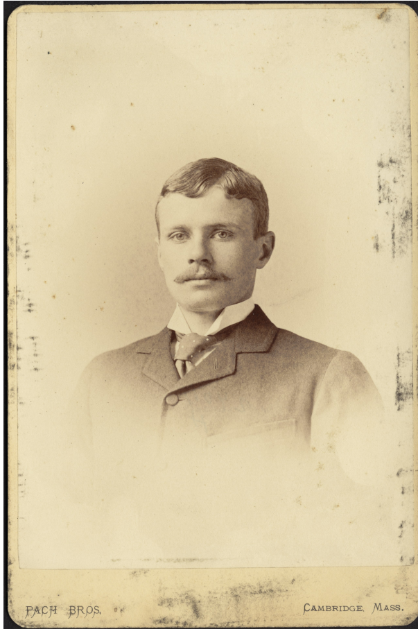
FIGURE 1. Julian Lowell Coolidge, 1873–1954

The result that Coolidge called “Clebsch’s Transformation Theorem” states that any arbitrary plane algebraic curve can be birationally transformed into another having only double points as singularities. Jean Dieudonné, quite possibly on Coolidge’s authority, also attributed this theorem to Clebsch in [Dieudonné 1974/1985, 37–38], whereas Bertini described it as well known, part of the folklore of the era. He republished his paper [Bertini 1891] three years later in Mathematische Annalen , after noticing that prominent French authors – among them Picard, Simart, and Poincaré – continued to mention the theorem without citing his proof. On the other hand, Bertini failed to reference [Noether 1871] and other subsequent papers that showed how to transform a curve to obtain another with simple multiple points, i.e. distinct tangents for each branch. This oversight was perhaps entirely innocent, but