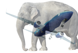
(e) 50% elephant 50% airplane