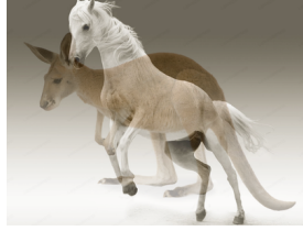
(b) 70% horse 30% kangaroo