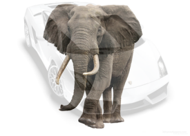
(h) 20% car 80% elephant