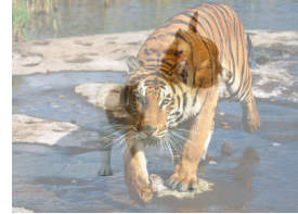
(g) 50% tiger 50% dog