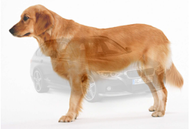
(f) 80% dog 20% car