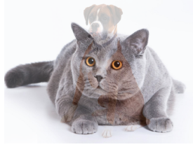
(a) 75% cat 25% dog