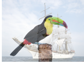
(d) 40% ship 60% parrot