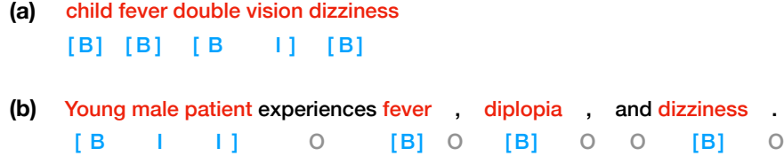
Figure 3: (a) and (b) are equivalent in terms of what they describe. However, (a) is what a typical user query looks like and (b) is what a sentence in a clinical note looks like. Clinical entities, regardless of their type, are colored red. The tags for each token (word or punctuation) are labeled below the token. Notice that (a) is incoherent as a sentence and is several entities compounded together without any conjunction words or punctuation. (b) on the other hand, is cohesive. It contains a proportion of “O” tags.

Despite the greater similarity between our task and the 2013 ShARe/CLEF Task 1, we use the clinical notes from the CE task in 2010 i2b2/VA on account of 1) the data from 2010 i2b2/VA being easier to access and parse, 2) 2013 ShARe/CLEF containing disjoint entities and hence requiring more complicated tagging schemes. The synthesized user queries are generated using the aforementioned dermatology glossary. Tagged sentences are extracted from the clinical notes. Sentences with no clinical entity present are ignored. 22,489 tagged sentences are extracted from the clinical notes. We will refer to these tagged sentences interchangeably as the i2b2 data. The sentences are shuffled and split into train/dev/test set with a ratio of 7:2:1. The synthesized user queries are composed by randomly selecting several clinical terms from the dermatology glossary and then combining them in no particular order. When combining the clinical terms, we attach the BIO tags to their constituent words. The synthesized user queries (13,697 in total) are then split into train/dev/test set with the same ratio. Next, each set in the i2b2 data and the corresponding set in the synthesized query data are combined to form a hybrid train/dev/test set, respectively. This way we ensure that in each hybrid train/dev/test set, the ratio between the i2b2 data and the synthesized query data is the same.