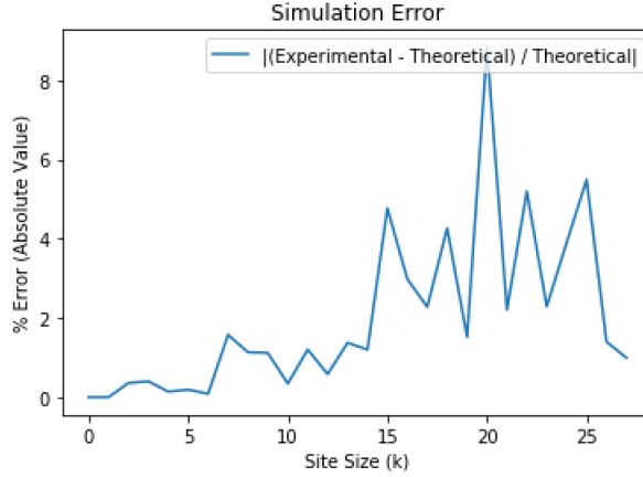
Figure 3: Percent Error of Simulation Results p = 0.8, r = 0.4, n = 5 * 10^6

As we already noticed, if f > f_c , there exists some time n after which no deaths from sites with fitness f or higher will occur. Since we assume \lim_{n \rightarrow \infty} \widehat{\mu}_n^f(1) = \beta_1 , the number of sites of size 1 with fitness \geq f grows at rate \gamma\beta_1 . In addition, each step, the number of sites of size 1 with fitness \geq f will either increase by one in a mutation event or will decrease by one in the case of inheritance. Thus, we expect the following to hold: