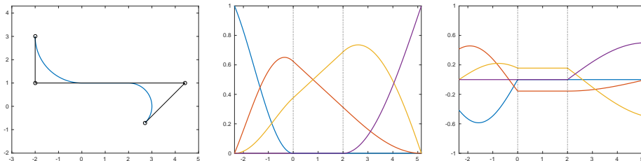
FIG. 8.2. A profile consisting of two circular arcs connected by a straight line defined in Example 8.2 (left column), together with the C^1 GTB-splines used in the representation (middle column) and their first derivatives (right column). Knot positions are visualized by vertical dotted lines.