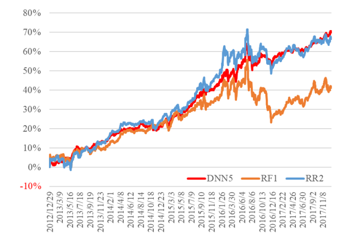
Figure 3. The Daily Cumulative Return of the Best R/R Long-Short Portfolio within DNN, RF and RR.

Figure 3 shows the daily cumulative return of the best R/R portfolio within DNN, RF and RR. The blue line (RR2) and orange line (RF1) fluctuate in return levels. Especially in the second half of the period, the orange line (RF1) is fallen significantly. On the other hand, the red line (DNN5) is a stable upward throughout the period.