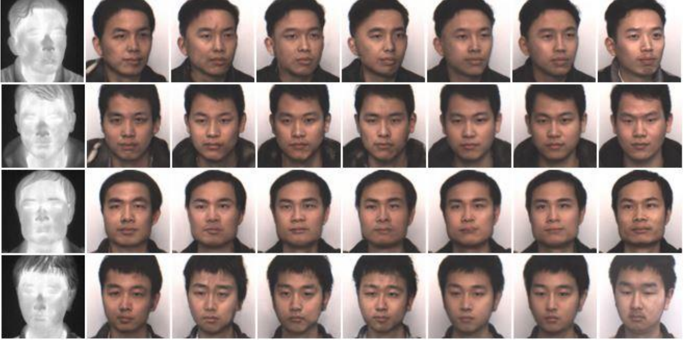
Fig. 5. The generated images using different different losses in PCSGAN framework over the WHU_IIP face dataset. The first and last columns represent the input and target images, respectively. The 2^{nd} to 7^{th} columns, from left to right, shows the generated images using AL, AL++CL, AL+CL+CPL, AL+CL+SL, AL+CL+SL+SPL, and AL+CL+CPL+SL+SPL losses, respectively.

ated images suffer with severe artifacts and lack of facial attribute information. However, over the RGB-NIR dataset, the resulting images suffer with the mode collapse problem and completely fail to generate the images. Thus, the Adversarial losses alone, are unable to generate the good quality realistic images and lead to a high domain discrepancy gap.