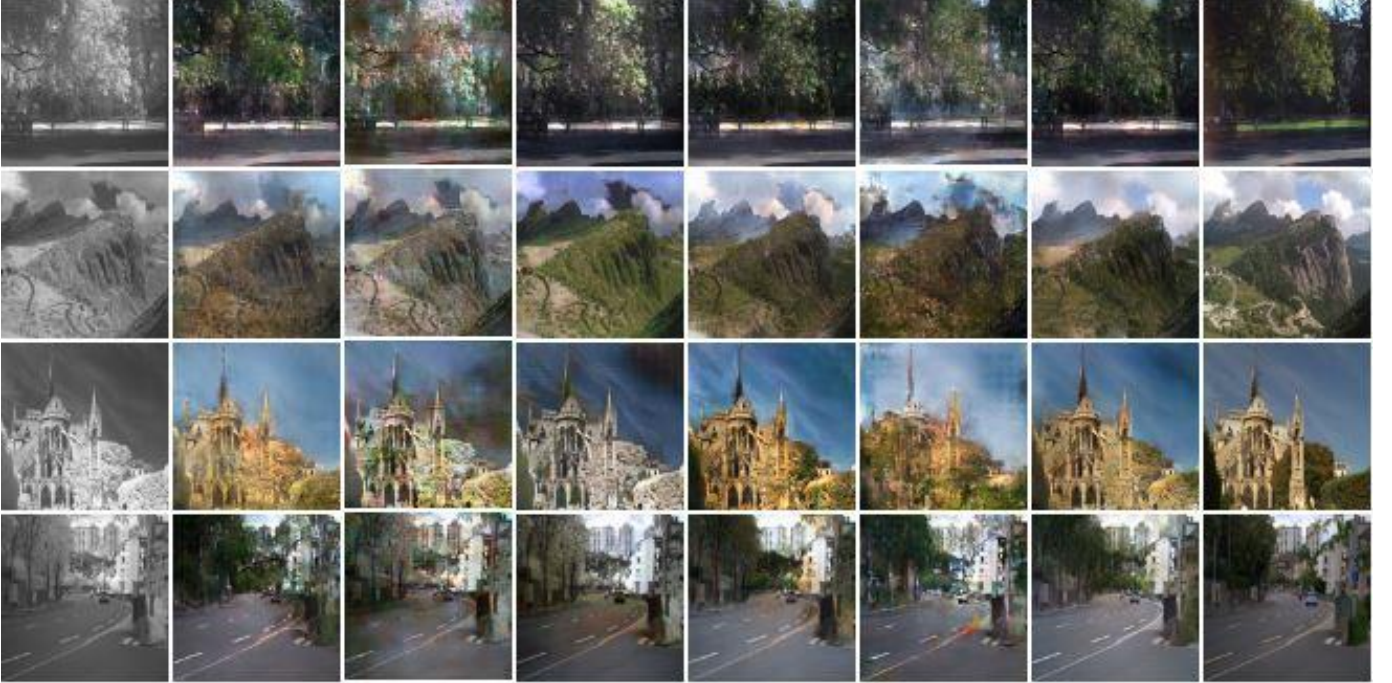
Fig. 4. The qualitative comparison of results over RGB_NIR scene dataset. From left-to-right input image, images generated by Pix2pix, DualGAN, CycleGAN, PS2GAN, PAN, PCSGAN and ground truth image, respectively.

Cycle-consistency Loss as CL , Synthesized Loss SL , Cycle-Perceptual Loss as CPL and Synthesized-Perceptual Loss as SPL . The ablation study is performed over the WHU-IIP face and the RGB-NIR scene datasets in terms of both the quantitative measures (summarized in the Table V and Table VI) and the qualitative measures (illustrated in the Fig. 5 and Fig. 6), respectively. The observations from this ablation study