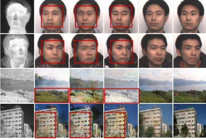
Fig. 1. The efficacy of the proposed PCSGAN model. The sample images in 1 st column are taken from the WHU-IIP (i.e., thermal images in 1 st and 2 nd rows) and the RGB-NIR scene (i.e., NIR images in 3 rd and 4 th rows) datasets, respectively. The generated images using Pix2pix [3], DualGAN [19], CycleGAN [9], and proposed PCSGAN method are shown in 2 nd , 3 rd , 4 th , and 5 th columns, respectively. The ground truth images in visible domain are shown in the last column. The rectangles in red color depict the artifacts, blurred and missing parts in the generated images by existing methods, which are overcome by the proposed PCSGAN method.

the generator network tries to minimize the same objective function by generating real looking VIS image to fool the discriminator network as depicted in Fig. 1. In addition to the adversarial losses proposed in GAN [2] and the pixel-wise similarity losses proposed in [3], [9], we also use perceptual losses introduced in [7] for THM/NIR to VIS image synthesis.