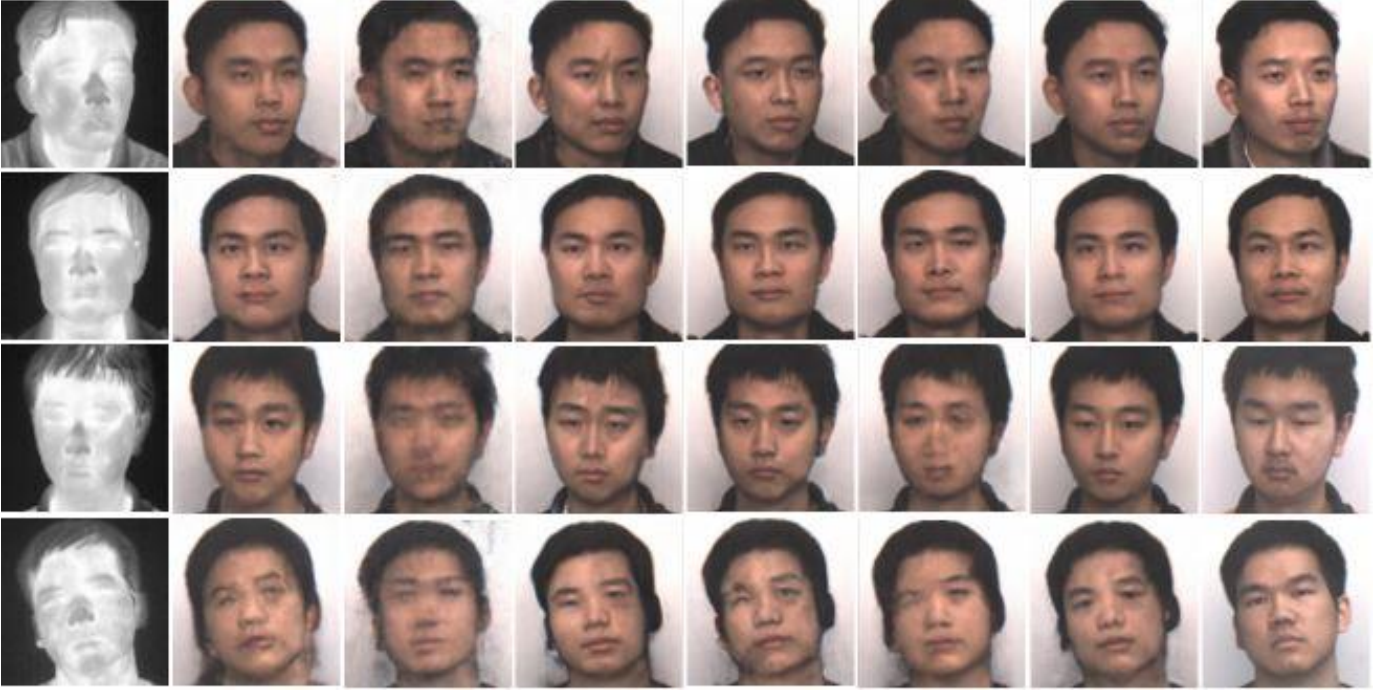
Fig. 3. The qualitative comparison of results over WHU_IIP dataset. From left-to-right input image, images generated by Pix2pix, DualGAN, CycleGAN, PS2GAN, PAN, PCSGAN and ground truth image, respectively.