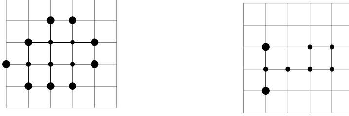
Figure 2: Two graphs with boundary included in \mathbb{Z}^2 , but only the first one is induced by a subset of vertices of \mathbb{Z}^2 (the bigger vertices are boundary vertices).

Because graphs with boundary induced by a finite subset \Omega of the set of vertices of a Cayley graph with polynomial growth satisfy a discrete isoperimetric inequality, we can deduce the following two corollaries of Theorem 1 for this particular case.