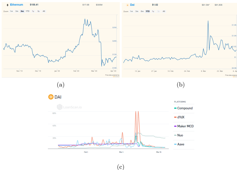
Figure 3: Black Thursday in March 2020. (a) ~ 50% ETH price crash (OnChainFX). (b) Deleveraging effects on Dai price and volatility (OnChainFX). (c) Deleveraging effects on Dai lending rate (LoanScan)