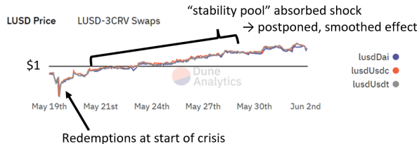
Figure 4: Effect of Liquity’s stability pool on LUSD price in Curve’s on-chain market in the May 2021 crisis. Deleveraging effect is delayed and smoother compared to Dai’s price effect on Black Thursday (cf. Figure 3b).

the mechanism is based on leveraged positions and leads to an endogenous price of the created or borrowed asset. We have characterized the risk that such structures feature intertwining of collateral liquidation spirals and short squeezes of the created asset. Synthetic assets generally use a similar mechanism just with a different target peg. Cross-chain assets that port an asset from a blockchain without smart contract capability (e.g., Bitcoin) to a blockchain with smart contracts (e.g., Ethereum) also tend to rely on a similar mechanism. In non-custodial constructions such as Zamyatin et al. [2019] and Synthetix [2020], vault operators are required to lock ETH collateral in addition to the deliverable BTC asset. They bear a leveraged ETH/BTC exchange rate risk and face similar deleveraging risk. In particular, to reduce exposure, they need to repurchase the version of the cross-chain asset on Ethereum.