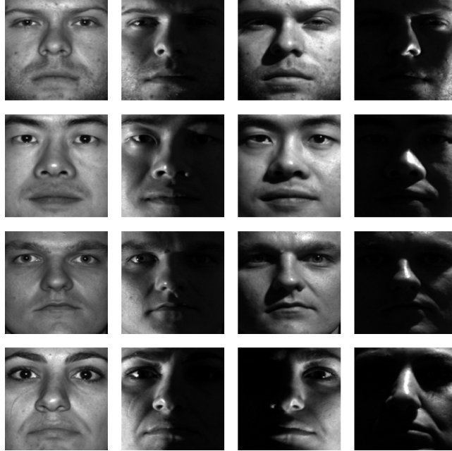
Figure 3: Sample face images from the Yale Face Database B.

It is also very interesting to check if a trained CNN can classify correlation responses received from images of completely different objects. For this, the Yale Face Database B [9] dataset was used, examples of images of which are shown in Figure 3. 3400 new correlation responses were obtained on the images from this dataset using both OT MACH and MINACE CFs. Table 2 shows the results obtained by processing these correlation responses. As we can see, in this case, the CNN shows the highest efficiency, despite the fact that it was trained on the correlation responses obtained from images of a different type. Or shortly: the CNN, trained on tanks responses, provides accurately classification of faces responses.