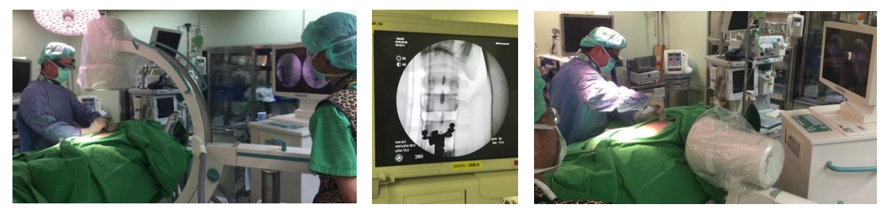
Figure. 7: The AR technology Smart surgical glasses connected with the C-ARM for Vertebroplasty surgery.

Figure. 6: The AR technology smart surgical glasses connected with the C-ARM for CRIF(Close Reduction and Internal Fixation) for distal radius fracture.