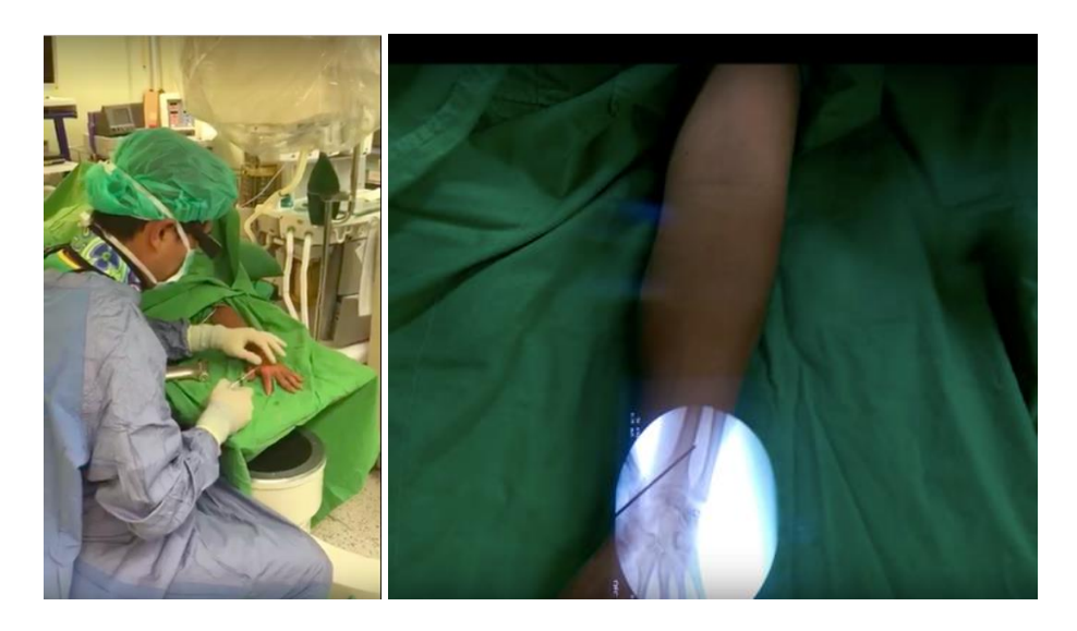
Figure. 6: The AR technology smart surgical glasses connected with the C-ARM for CRIF(Close Reduction and Internal Fixation) for distal radius fracture.

Figure. 5: The AR technology smart surgical glasses connected with the C-ARM for pelvic surgery and also displays CT data as per the surgeon's preference.