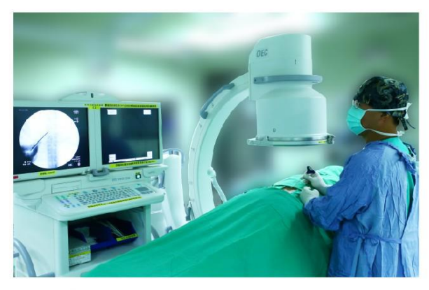
The surgeon needs to focus on the monitors.