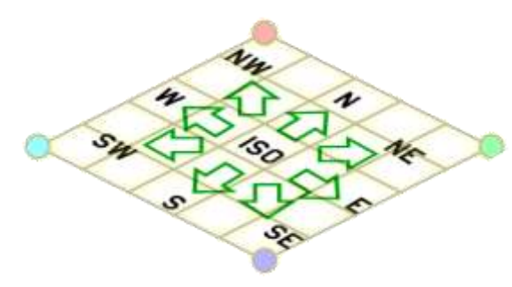
Figure 3.4. Eight-way character direction

To apply the character for education games, algorithm learning in isometric display, it needs to be created in accordance with the standard isometric by creating a character that has fourway or eight-way movements.