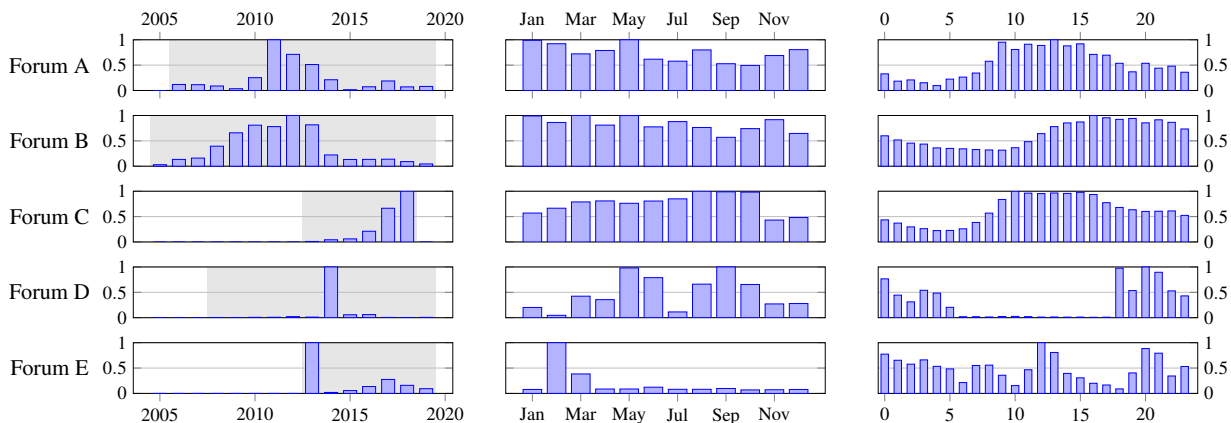
Figure 1: Histograms (normalized to maximum bin value in forum) for (left) postings per year, with shading indicating the years for which we have post data for the forum, (middle) postings per month of year, and (right) postings per hour of day.