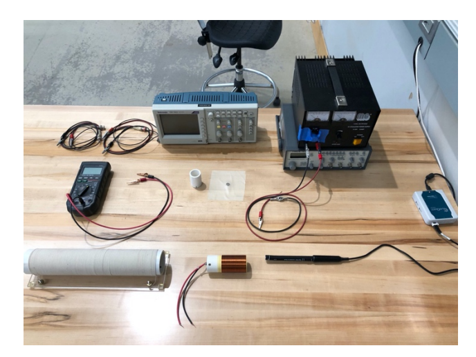
Figure 3: The equipment used to measure \mu_0 is shown. Note that that a signal generator and oscilloscope were provided, but they were not used in the measurements described here.