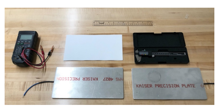
Figure 1: The equipment used to measure \epsilon_0 is shown. Note that the aluminum plates say "PRECISION PLATE", but there was nothing special about these plates. They were pieces of stock that were cut to the same dimensions.