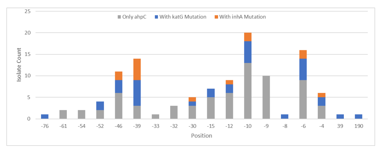
Figure 3: Mutations in intergenic region between the genes oxyR and ahpC (106bp in H37Rv genome positions 2,726,088 to 2,726,192). Negative positions are nucleotide positions relative to the start of the gene ahpC on the positive strand while positive positions are codon numbers in the gene's ORF. Blue bards indicate isolates that also harbor KatG mutations, while orange bars indicate isolates that also harbor inhA (promoter or gene) mutations. Grey bars indicate isolates that harbor no mutations in inhA (promoter or gene) or in KatG. Seven isolates had a mutation in katG and inhA .

In total, 113 (2.01%) resistant isolates harbored a mutation in this region or in ahpC coding region (2 isolates). Of the 113, 31 (27.43%) isolates also harbored a KatG mutation, while 14 (12.39%) harbored an inhA (promoter or InhA) mutation. Seven (6.19%) of the 113, harbored a mutation both in KatG and inhA (promoter or InhA). Importantly, 75 (66.37%) of the 113 resistant isolates, did not harbor a mutation in KatG, or inhA (promoter or InhA).