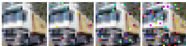
Figure 1. An example of clean and contaminated images. We apply the salt and pepper noise to each pixel. The probabilities of noisy pixels are 0%, 1%, 2%, and 4% from left to right, respectively.

clean datasets, WDRO+MIX performs comparably with MIXUP and achieves significantly higher accuracy than ERM and WDRO when the sample sizes are 2500 and 5000. When the sample sizes are 25000 and 50000, either WDRO or WDRO+MIX shows lower accuracy than MIXUP and ERM. For the contaminated datasets, either WDRO or WDRO+MIX achieves significantly higher accuracy than ERM and MIXUP in all settings. This shows that the proposed method is robust to contamination of data.