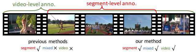
Figure 1. Comparison between previous methods and our approach. Previous methods require segment-level annotations (start and end times of actions) during training, which leads to high human labeling cost. In contrast, our method can be trained with video-level annotations (video-level action labels) and is flexible to utilize ( full/partial ) segment-level supervision when it is available.

Temporal Action Localization aims to detect temporal action boundaries in long, untrimmed videos. Most previous methods are under offline settings [2, 4, 5, 10, 25, 31], where they can observe the entire action before making decisions. However, applications such as surveillance systems and autonomous cars, are required to interact with the world in real time based on their accumulative observations up to now. Online Action Detection [6] is proposed to address this problem, where methods need to identify occurring actions moment-to-moment without access to future information. With different focuses, recent online action detectors consider two sub-tasks: (1) online per-frame action recognition [6, 9, 28] and (2) online detection of action start [11, 24]. The former task focuses on the general capability of recognizing the action category of each coming frame. On the other hand, detecting