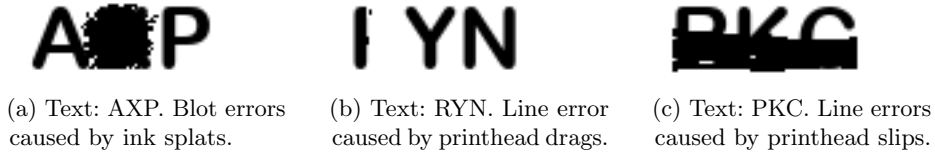
Fig. 1: The 3 major type of print errors found in printing press. Other types of errors in most part are subsumed in either of these categories. Note that these are simulations of zoomed-in scans of text segments. A typical sheet may contain more than 500 such words. In terms of pixel ratio, each word shown here is about 0.1% of the full sheet.

artifacts have been chosen to be just big enough to cause an ambiguity in the text. The text images were generated using the Python Imaging Library (PIL). All possible 3 letter words were made as grayscale images of pixel dimension 35 \times 100 . Arial bold font was used. They were labelled as good images. The three types of errors were distributed equally on the entire dataset of 17576 ( = 26 \times 26 \times 26 ) images. These were labelled as bad images.