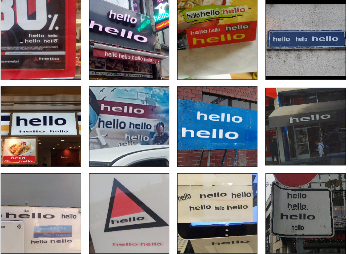
Figure 4: Text inpainting examples