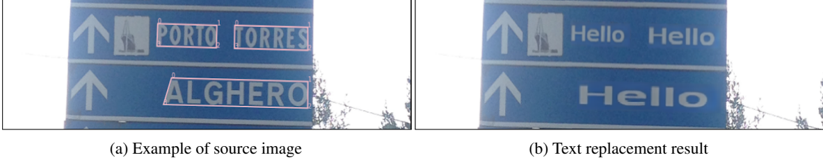
Figure 1: Illustration of the text replacement task

This paper is structured as follows. In Section 2, we describe works related to the proposed approach. Then, in Section 3, we describe the proposed approach, we describe the non-uniform conditioning layer in Section 3.1 and the adopted architecture in Section 3.2. Then we describe the experiments performed in Section 4. Section 5 concludes the paper.