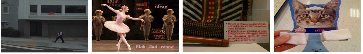
Figure 5: Samples from text detection datasets