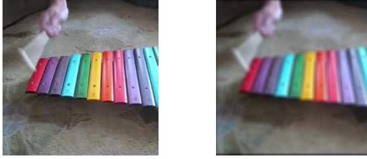
FIG. 5.5. Example 2: Original frame no. 5 (left), blurred and noisy frame no. 5 (right).