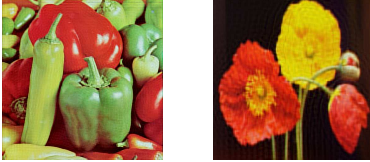
FIG. 5.4. Example 1: Restored images by Algorithm 5, peppers (left), papav256 (right).