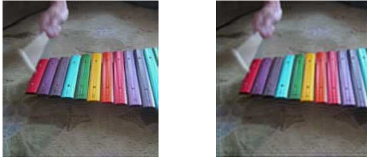
FIG. 5.6. Example 2: restored frame no. 5 by Algorithm 4 (left), and restored frame no. 5 by Algorithm 5 (right).