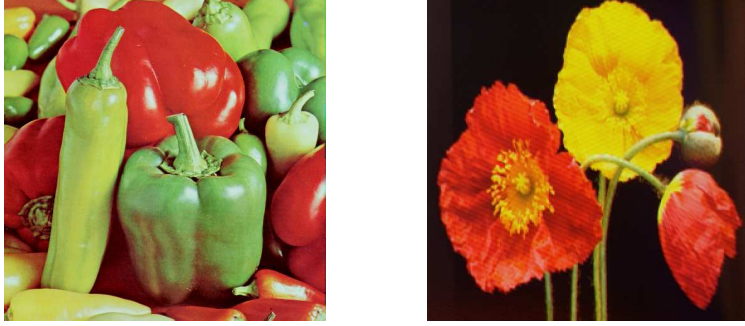
FIG. 5.1. Example 1: Original RGB images: peppers (left), papav256 (right).

uses a similar stopping criterion. We can see that the methods yield restorations of the same quality, but the new proposed methods perform significantly better in terms of cpu-time.