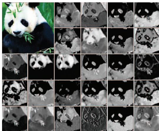
Figure 1: Visualization of input image (top-left) and some input feature maps of the second stage in ResNet-50. Many of them appear much pattern similarity. Therefore, some representative feature maps can be chosen to supplement intrinsic information, while the remaining redundant only need to complement tiny different details.

The recent years have seen the remarkable success of deep neural networks. However, this booming accuracy comes at the cost of increasingly complex models, which contain millions of parameters and billions of FLOPs [He et al. , 2016; Devlin et al. , 2019]. Therefore, recent efforts try to reduce parameters and FLOPs while ensuring the model without a significant performance drop.