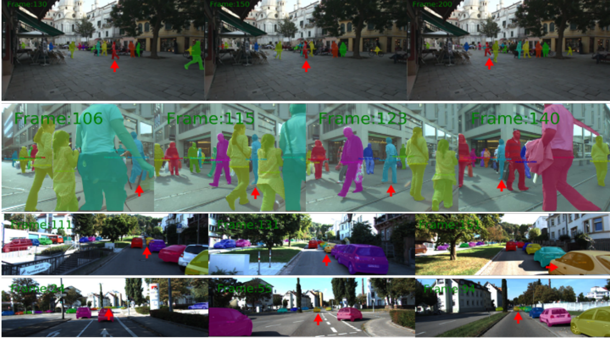
Figure 2. Qualitative results of the proposed IA-MOT. 1 st row: MOTS20-01 (static camera); 2 nd row: MOTS20-06 (stroller-mounted camera); 3 rd row: KITTI-MOTS-0011 (car-mounted camera, up-slope view); 4 th row: KITTI-MOTS-0012 (car-mounted camera, turning view). Red arrows indicate that the targets are tracked robustly even with frequent occlusion or turning.