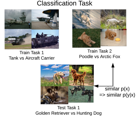
(b) For image classification, since p(x) in Test Task 1 and Train Task 2 would be overlapping (all are animals), our hypothesis is that the discriminative features for these will also be related.