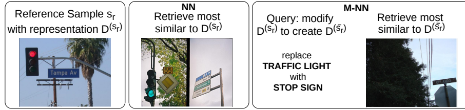
Fig. 2: Example of a retrieval result for both NN and M-NN. For NN, based on the representation D(s_r) , the most similar instance is retrieved. For M-NN D(s_r) is modified into D(s_r^{\bar{}}) before retrieving the most similar instance.

(b) F1 score for a simple logistic regression on pre-trained representations to classify a previously unseen label ("panting dogs"). For the last three models, n_l = 300 .