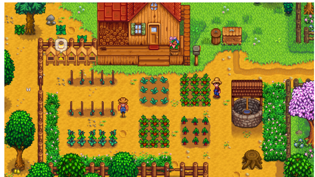
Figure 1: Screenshot from Stardew Valley of a farm with crops growing.

Part of the challenge in using COTS (commercial, off-the-shelf) games is that few of them are modifiable from a technical or legal standpoint. Even in games that allow modding, the modding activity is often limited by the game publisher to creating new maps for players to explore, adding customized appearances of game objects, or changing the appearance of the user interface (Thiel and Lyle, 2019).