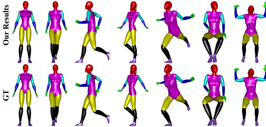
Fig. 4. Some visual results of our method on the test set. The top row and the bottom row respectively show the results of our method and the corresponding ground truth models.