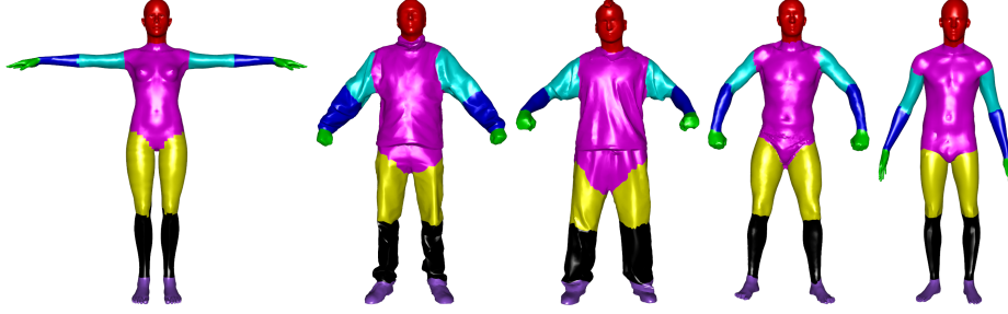
Fig. 3. Examples from the the training set.