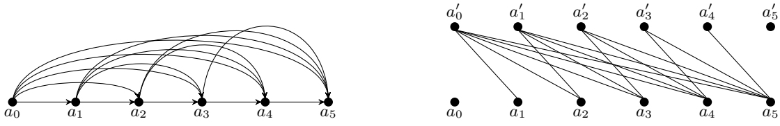
Figure 2. Turning an ordering to the relation F .

Note that the relation F is irreflexive and symmetric, i.e., (A^*, F^{A^*}) is already a graph, which is illustrated by Figure 2. Observe that F contains the whole information of the ordering <^A up to isomorphism.