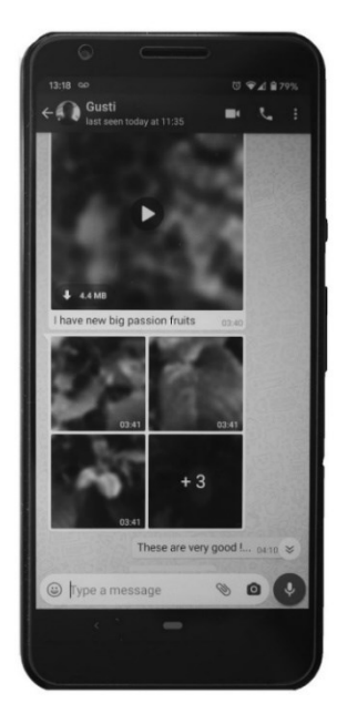
Figure 7. Field videos sent from local data harvesters to the research team for evaluation.

We describe in a companion document how our video-tolabeled-images system works, how we trained several machine learning classifiers on the resultant data, and how the classifiers performed in several different tests [5]. The result of these operations is a curated image collection of 26 ethnobotanically