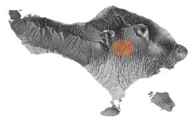
Figure 1. The island of Bali with the field study site in Central Bali.

Broadly, Return to Bali asks the following question: How can we represent forms of knowledge that have to date not been represented in machine learning? Currently, the critical discourse on representation in machine learning systems in America and Europe