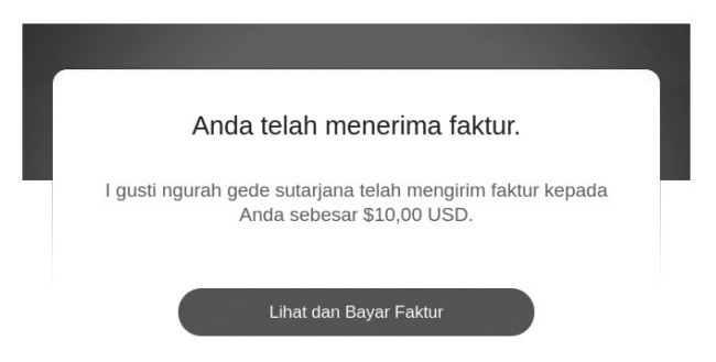
Figure 8. Confirmation of electronic payment to local data collectors.

Applying machine learning to ethnobotany also generates new research questions for machine learning proper. While the challenge of representing the interwoven threads of knowledge, experience and best practices contained within local ecological