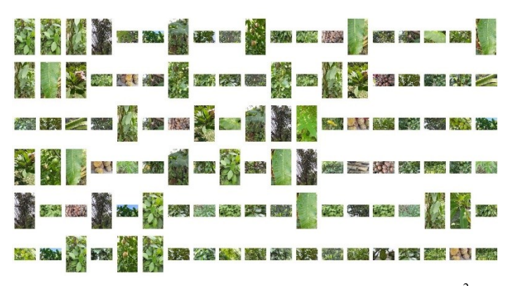
Figure 9. Samples from the current version of the bali-26 data set.<sup>2</sup>