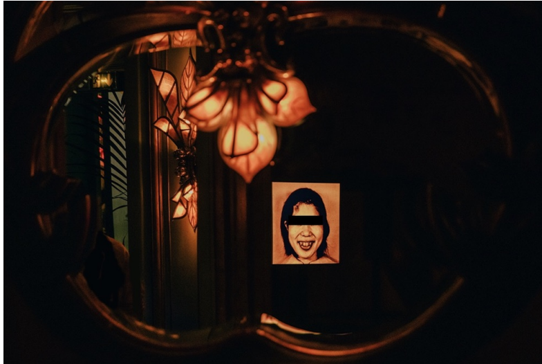
Figure 2: “Making Faces” exhibition at Maxim’s, Prada Mode Paris.

research 5 , but this entails an untenable semantic stretch.