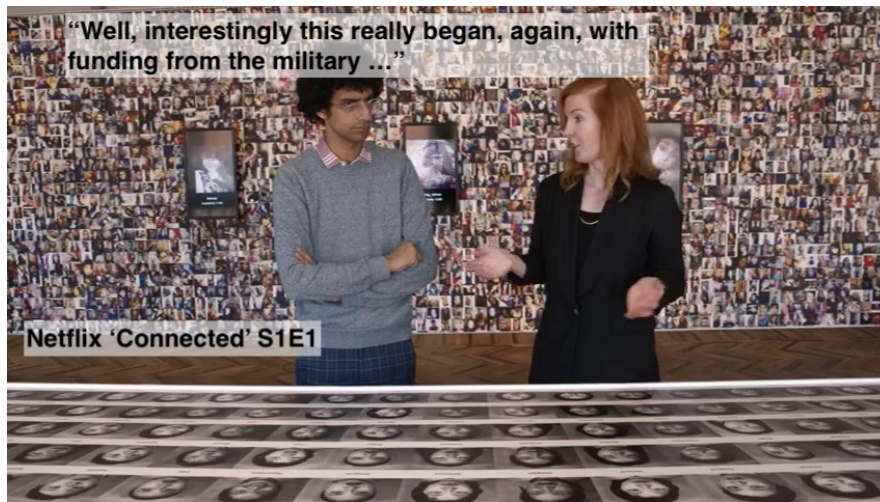
Figure 4: An unsupported claim.

anyone who shared it on social media to unwittingly breach informed consent and the JAFFE terms of use. 10