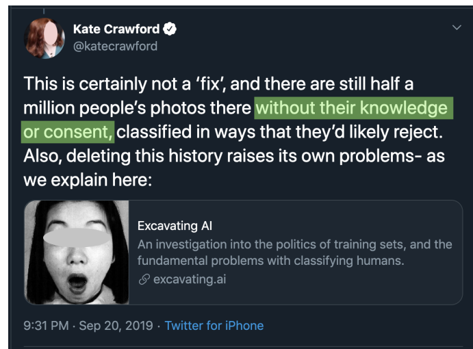
Figure 3: An astonishing tweet.