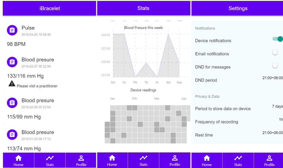
Fig. 2. Mobile application user interface screens

When equipped, the dedicated sensors are positioned along a peripheral artery (usually the radial artery) which they make contact with without flattening it or disturbing blood flow. The waveform of the pulse is captured by the sensor and sent to the microcontroller, which discards corrupt data sequences caused by incorrect placement of the bracelet. Correct waveforms are sent to the paired mobile device. The accompanying application determines minimum and maximum values based on the Hill Climbing method [23]. The algorithm is implemented at mobile device level to maximize the bracelet's battery life. The most important parameters obtained are the systolic and diastolic blood pressure values.