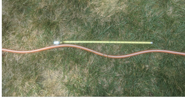
Figure 4: A typical example of an undulation with \lambda = 66 cm.