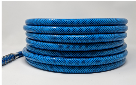
Figure 2: Composite water garden hose with reinforcing mesh.

A popular current design consists of a polymer lining inside an elastomer tube, containing helically wound and nearly inextensible filaments with opposite helicity. A typical garden hose [3] with such structure is shown in Fig. 2.