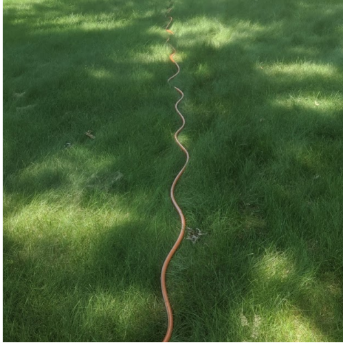
Figure 1: Example of undulations in a garden hose.

watering, it is first ensured that the control valve by the nozzle is closed. Next, the inlet valve is opened; at this point, water flows into the hose, pressurizing it. The outlet valve is then opened; water flows through the hose and sprays out of the nozzle, which is directed at whatever is to be watered. When watering is completed, the outlet valve by the nozzle is typically closed first, followed by closing the inlet valve. At this point, the hose, still pressurized, is lying on the grass, often in a fairly straight line. If the outlet valve is now opened to relieve the pressure in the hose, many hoses exhibit a remarkable phenomenon: they visibly elongate as water is expelled and form sinusoidal undulations along their length. The same phenomenon occurs due to simple leakage of water from the hose. Two questions immediately arise: why does the hose elongate, and what is the mechanism of wavelength selection? We attempt to answer both questions below.