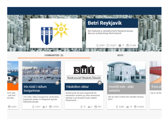
Figure 3: Screenshot of the Better Reykjavik platform

can be voted on by the online community. At 12:00pm on the last weekday of every month, the 5 most popular ideas are reviewed by Reykjavik City Council. The council's response is published on the platform.