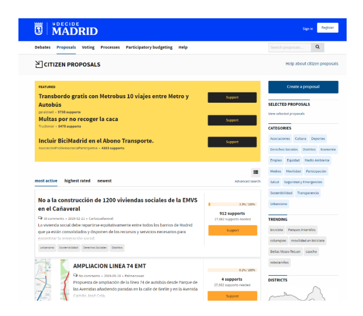
Figure 2: Screenshot of the Decide Madrid platform

The online platform (Figure 2) can be divided into four components: proposals and votes, debates, participatory budgeting and consultations. Within the proposals and votes section, a resident may create a proposal for a new local law which is shared on the platform for 12 months. During this time other residents may comment on the proposal or cast votes of support. If the proposal gains approval from 1% of the census population with the right to vote (the equivalent of 27622 supporters) it is positioned at the top of the webpage. The proposal is then debated for another 45 days before going to a final public vote. If this is approved, the Council has one month to draw up technical reports on the legality, feasibility and cost of the proposal which are all published on the platform [33].