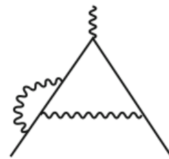
Fig. 1: Feynman diagram IIc.

The error was found in the calculation of the Feynman diagram IIc. According to the Karplus and Kroll's, original calculation, the value of diagram IIc was -3.178 while in the Petermann correction the value of diagram IIc was -0.564.